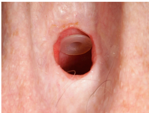
Image: TEP valve visible through the laryngectomy stoma, between the posterior wall of the trachea and the oesophagus behind.

These devices are often known as TEP (from the US spelling of 'esophagus'). They can be created at the time of primary surgery, or later. A puncture is made into the posterior portion of the trachea into the oesophagus behind. Exhaled air can be forced through this connection by the patient by covering their stoma in expiration. Air passes through the pharynx as above and oesophageal speech is possible. A one-way valve is usually placed into the puncture site to reduce the risk of contamination of the airways with GI contents. Some stoma covers incorporate an additional valve to direct air through the TEP valve without manual occlusion of the stoma, which makes hands-free speech possible. TEP valves should not be removed in an emergency as they should not occlude the airway and removing them will not improve acute respiratory problems.